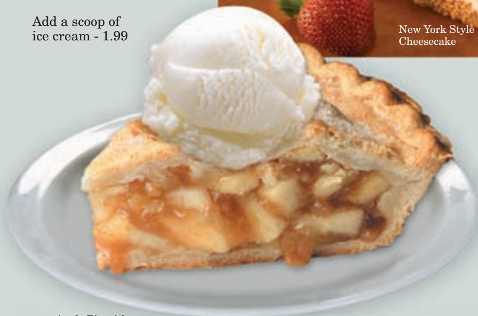
Apple Pie with a Scoop of Ice Cream