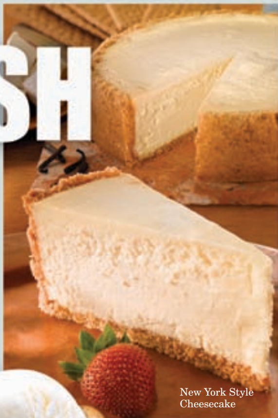
New York Style Cheesecake